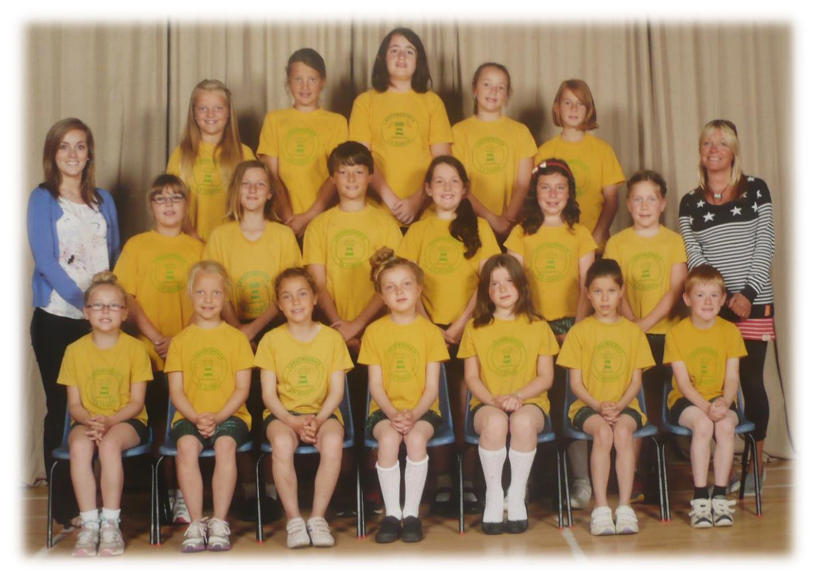
Members of last year's Dance Club, showing the school's PE Kit